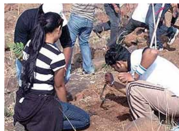
BNY Mellon volunteers signed up to "adopt" the trees for the next three years.

To commemorate the company's 225th anniversary, more than 300 employees in the Pune office came out for a "Tree Plantation Drive," planting 225 trees on a hillside below a local temple.