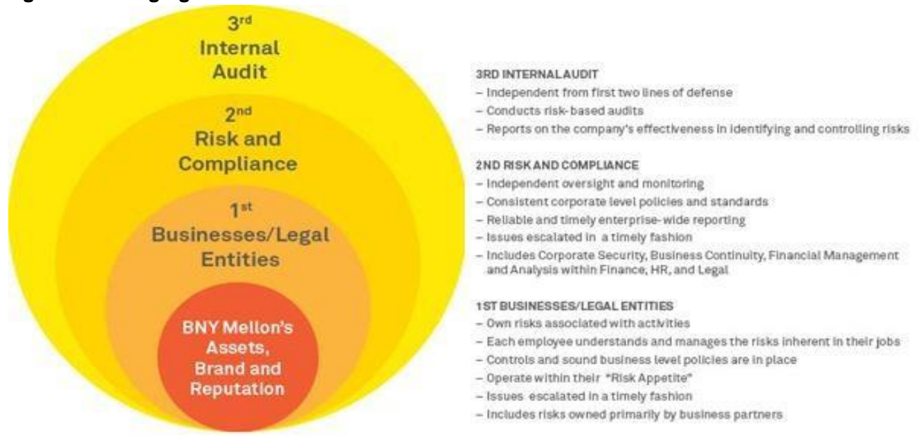
Figure 2: Managing Three Lines of Defence

The risk management function monitors and identifies emerging risks with a forward-looking approach. It provides risk management information to the PSIL Board and governance committees, and contributes to a "no surprise" risk culture. It aligns closely with Compliance (2LOD) and Internal Audit (3LOD) plus Finance and Treasury (as 1LOD control functions). It independently educates staff, promotes risk awareness and continually makes improvements, whilst monitoring progress against defined success criteria for improving the effectiveness of the risk function.