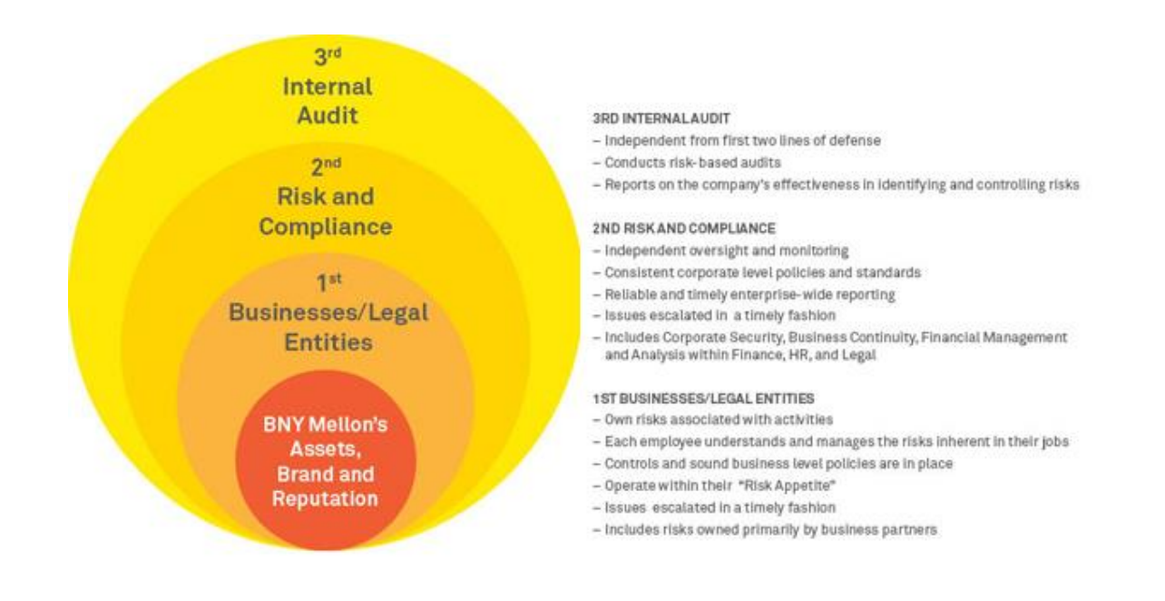
Figure 3: Managing Three Lines of Defence

BNY Mellon Risk and Compliance policies and guidelines provide the framework for BNYMH's risk identification, internal controls, monitoring, reporting and escalation. Risks are managed within specialist risk teams (e.g. market, credit, operational) or via line of business risk teams.