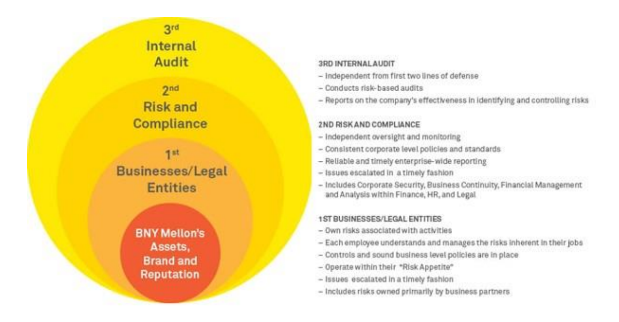
Figure 2: Three Lines of Defence

BNYMH fully complies with the corporate culture of risk management as Risk is managed at: