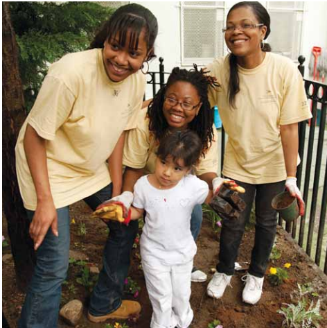
Employee volunteers teach gardening skills at the Children's Aid Society.

With millions of American children living in poverty, a new, warm winter coat is the single most requested item by schools and social service agencies. This past year, thousands of children were warmer thanks to a special cross-regional partnership with Operation Warm when employees helped to distribute new coats to 6,000 children in the tri-state area.