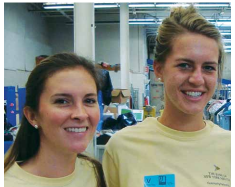
Volunteers enjoy a day at Goodwill.