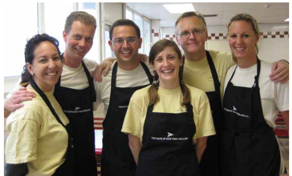
A BNY Mellon team regularly prepares breakfast at the Whitechapel Mission.

BNY Mellon employees also volunteer for the charity’s life skills center, assisting with form completion, housing referral applications, and CV and interview preparation.